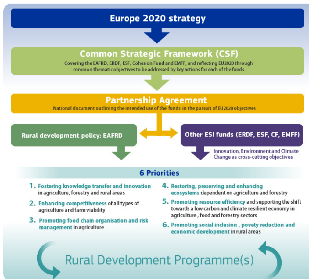
Figure 2. Priorities of the ESIF.