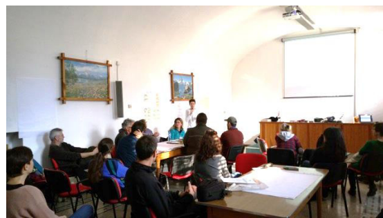
Figure 2: the moderators reported on the results of each discussion table.

On day 2, the following topics were discussed in six groups: communication, prevention, compensation and financing (including EARDF funds).