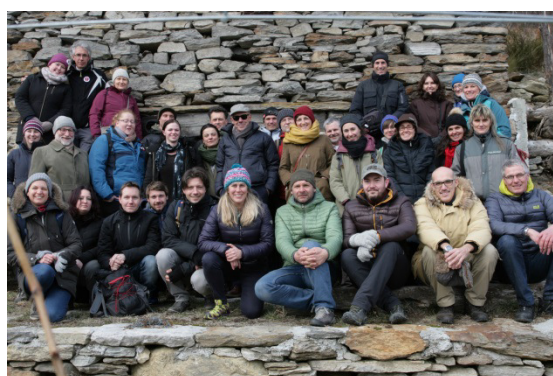
Figure 1: group photo of the participants (Ph: Marianna Elmi).

The detailed programme of the workshop is contained in attachment 1.