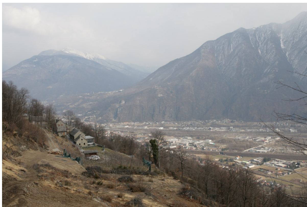
Figure 3: The view from Agriturismo La Tensa.

Roberto Viganò, scientific responsible of the project “Eco-food value chains processes” explained the approach of this project dealing with the valorisation of local game in a controlled value chain which, at the same time, helps to prevent poaching.