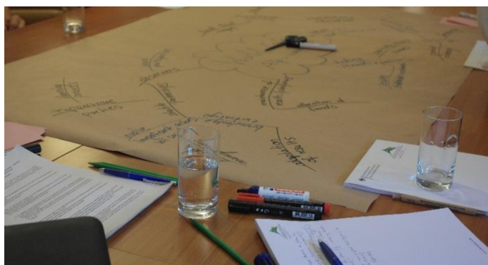
Photo: World-Café outcomes

The main outcomes of each of the four World-Café sessions are summarised in a short report below.