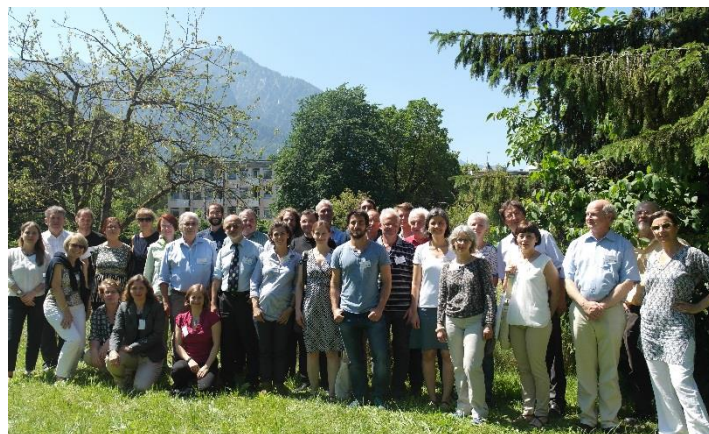
Group photo: Symposium participants in Bad Reichenhall

and private soil stakeholders. Alpine soil protection challenges were also discussed and recommendations for future joint activities for enhanced Alpine soil conservation and improved implementation of the Protocol were developed in four World-Cafés.