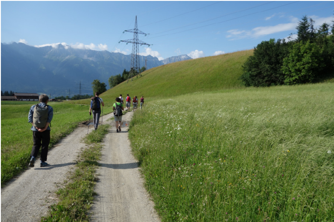
Figure 4: the We Are Alps 2016 tour.

economic development as the basis for a good quality life in the Alps. As always in the We are Alps tour, the group travelled exclusively by sustainable means of transport. During the tour, participants had the opportunity to meet the actors of flagship projects contributing to innovative approaches on topics such as water and forest management, spatial planning, transport, tourism, farming, energy production and savings and many more. The second day of the tour was the opportunity for the participants to meet the German State Secretary Schwarzelühr-Sutter and the Bavarian minister Scharf at the visit to the Sylvensteinspeicher Dam and to see the jubilee Alpine Convention stamp.