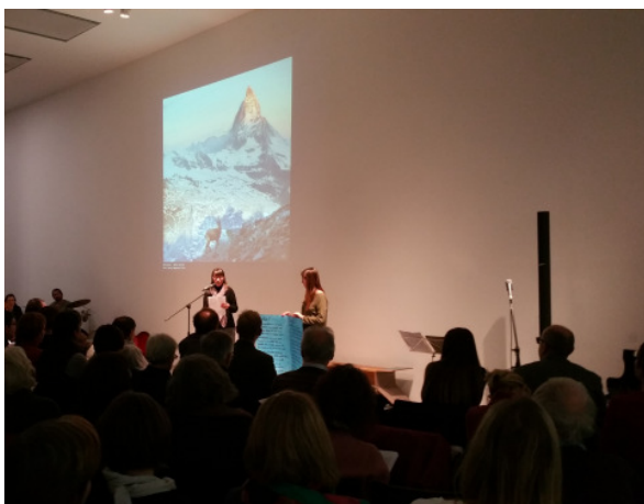
Figure 2: the audience at the “Reading Mountains” event in Bolzano/Bozen.