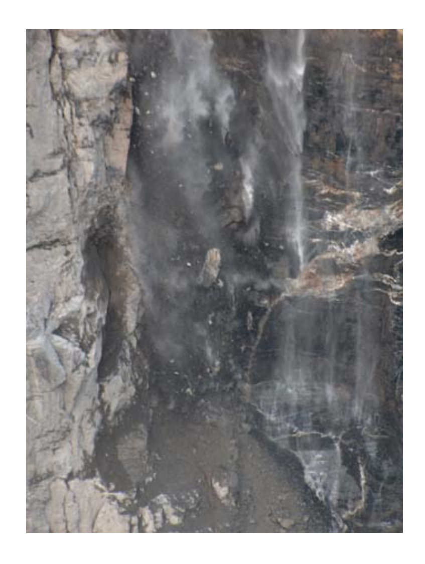
PLATFORM ON NATURAL HAZARDS OF THE ALPINE CONVENTION PLANALP