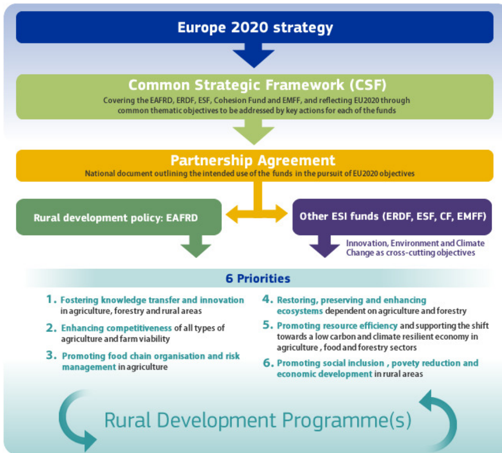
Figure 2. Priorities of the ESIF.