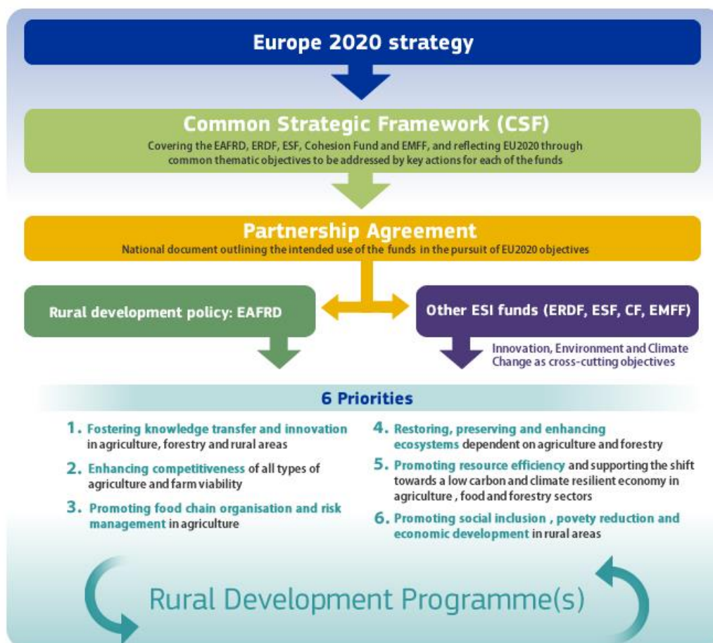
Figure 2. Priorities of the ESIF.