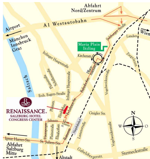
Map of the venue